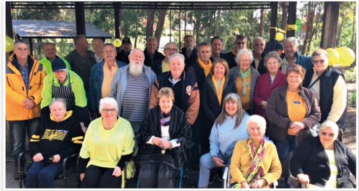
Fundraising BBQ for Cancer Council

Several of our members also attended Guardian Funerals Biggest Morning Tea. Guardian Funerals Blacktown have been our sponsors from the since our branch commenced some 12 years ago. A great morning tea was presented but no raffle prizes this year for our members.