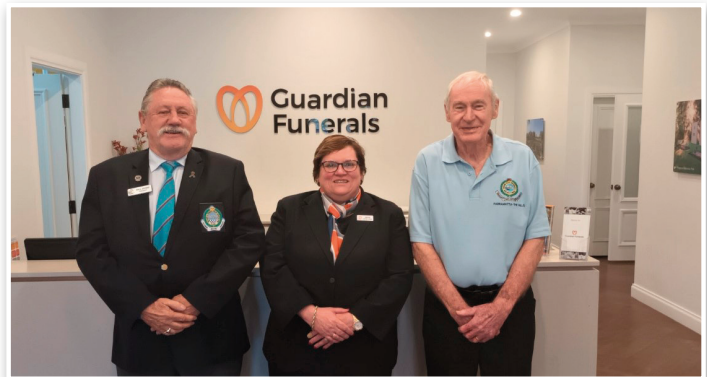
Guardian Funerals Biggest Morning Tea

Several of our members also attended Guardian Funerals Biggest Morning Tea. Guardian Funerals Blacktown have been our sponsors from the since our branch commenced some 12 years ago. A great morning tea was presented but no raffle prizes this year for our members.