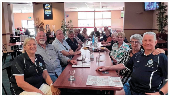
Group at Jinderra