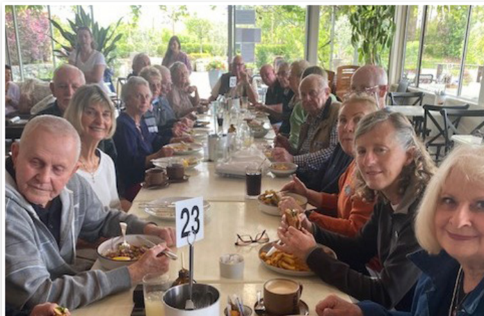
Members at our lunch at the Abundance Cafe, Sancrox.