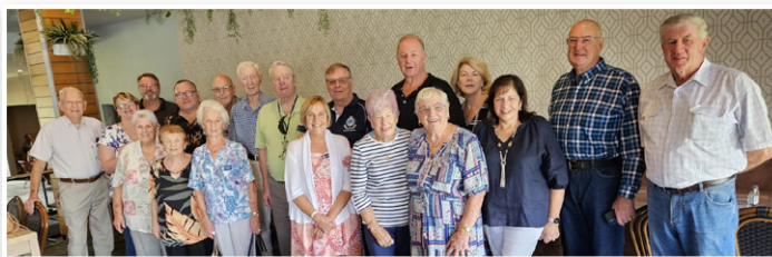
Group photo, Kiama Illawarra RFPA 18.3.2024 Windang Bowling Club

In recent issues we missed putting in a great photo of a combined (Illawarra & Kiama) social luncheon at the Windang Bowling Club which was held on the 18 March 2024 , a total of 20 members from both branches including the bloke who took the shot. Social events are so important to our members and joining with other branches is a great way to meet with other members.