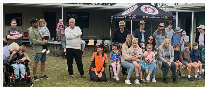
Sydney Search Dogs

On Saturday 2nd November, 2024 the Macarthur RFPA Branch had a Family day at the Sydney Search Dogs at Rossmore. After an enlightened presentation that endorsed the ability and skills displaying the capabilities of the dogs in locating Missing Persons as well as loss of life during Natural Disasters we were made aware of their abilities with a display incorporating walking across a ladder and up a flight of stairs to a platform.