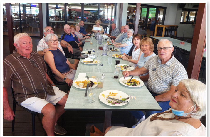
Northern Rivers Christmas function