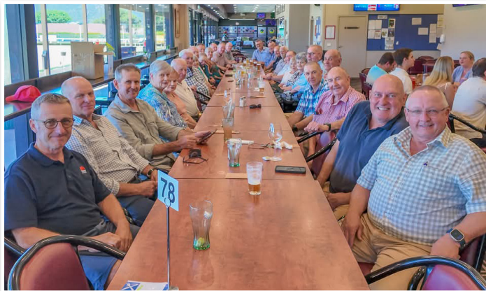
Group hanging out for Xmas Lunch at table 78, South Tamworth Bowlo