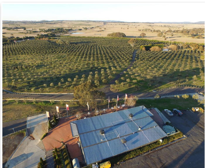
Federa Olive Grove