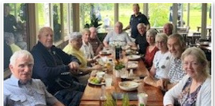
Coffs Harbour Nov meeting

In October we gathered at the Coramba Hotel for lunch.