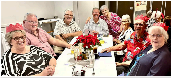
Some of our Christmas Dinner revellers