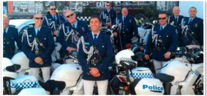
Photo shows the Police Motorcycle Escort for HRH Prince William and Kate Middleton Duchess of York, during their April 2014 visit to Manly Beach Sydney.