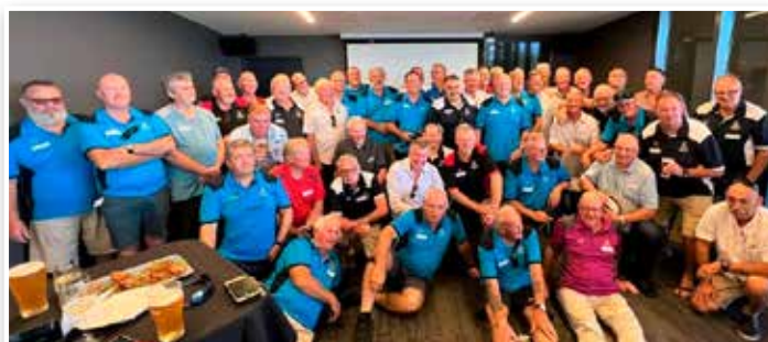
Qld Cadets Reunion - with Mal Meninga