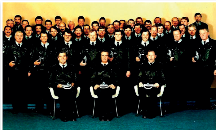
TRG - Photo Courtesy Alan Barwick