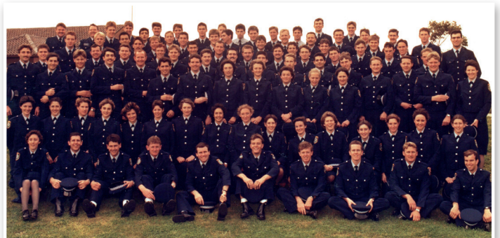
Class 205 attested on the 26 October 1984