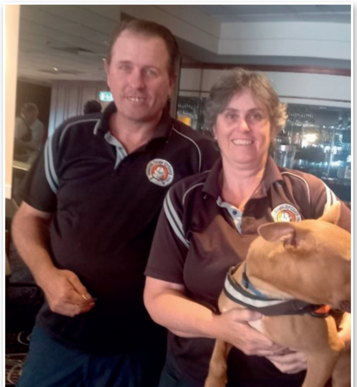
GUEST SPEAKER. Search Dogs Sydney Inc

BBQ - FRIDAY 20 October 2023 with bacon and egg rolls and cakes for sale by the Social Committee.