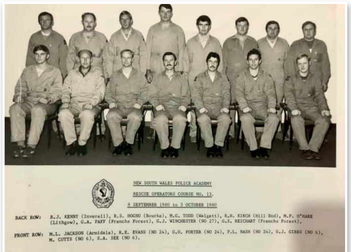
Police Rescue 1980 - courtesy Charlie D'Agostino