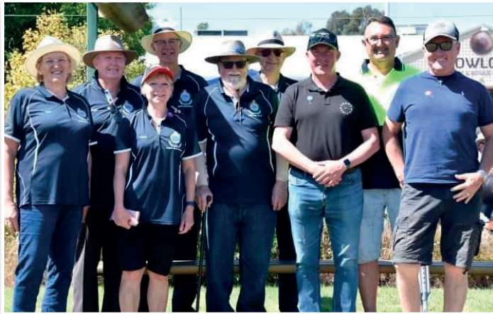
Team, formers & serving.