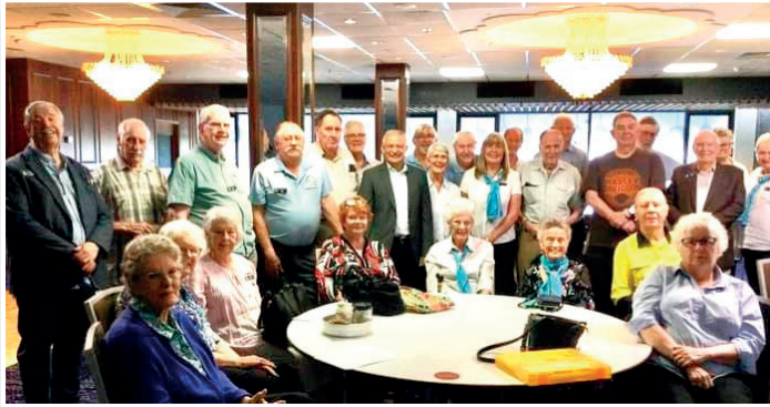
Branch Meeting Group

At our November meeting we had 28 attendees and the Chairman has suggested that next year we might consider meetings every two months and the alternate month we have Social Outings.