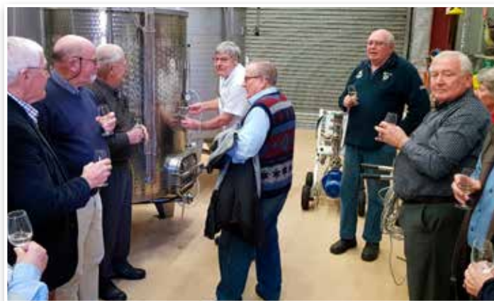
Christmas at Kurri TAFE

2021 was not a good year for meetings, so we only held a few in the Hunter.