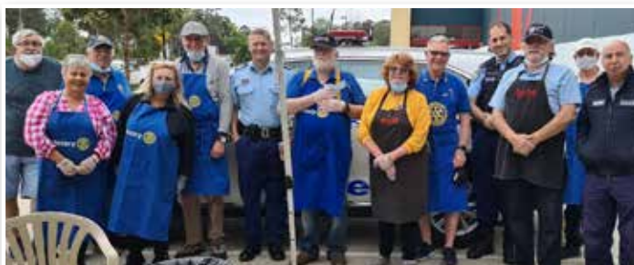
Helping at Rotary BBQ to get Defibrillators into Police Cars Blacktown LAC

Looking forward to some social events in 2022, we have arranged a Christmas in July at the famous Carrington Hotel in Katoomba with many choosing to book an overnight stay. Let's cross our fingers for some snow this year!!