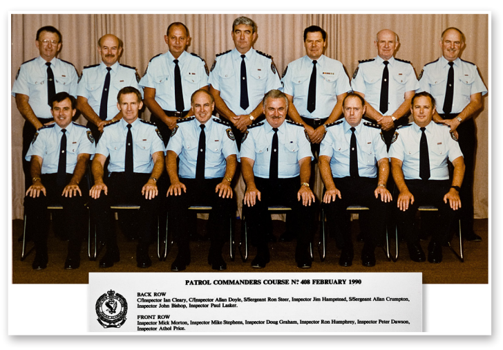
Patrol Commander's Course 1990