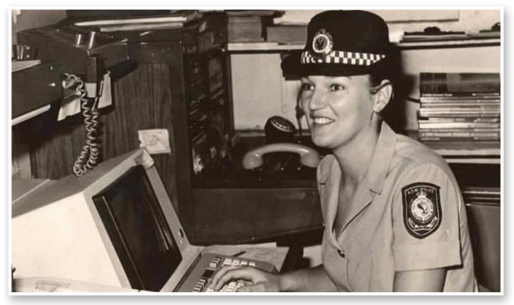
Computerisation - and the Operator is? ......