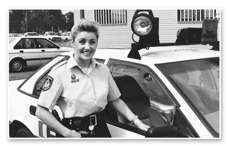
Anyone know her name