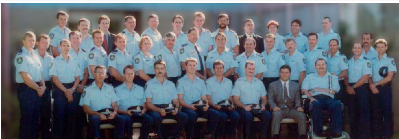
Dapto Police 1990s